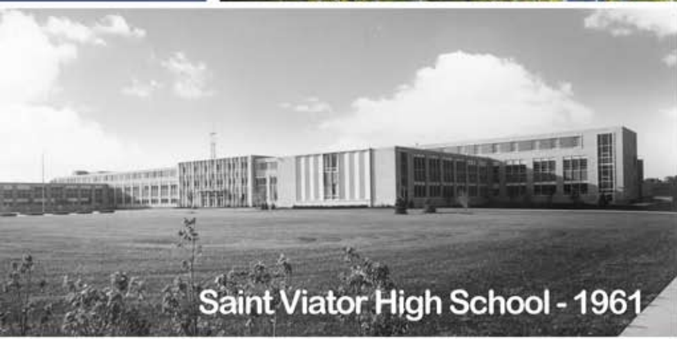
Saint Viator High School - 1961